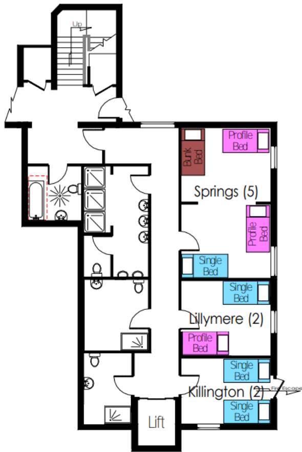
Ground Floor: Lakes Corridor (all accessible)